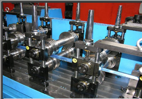
Detail of roll forming line