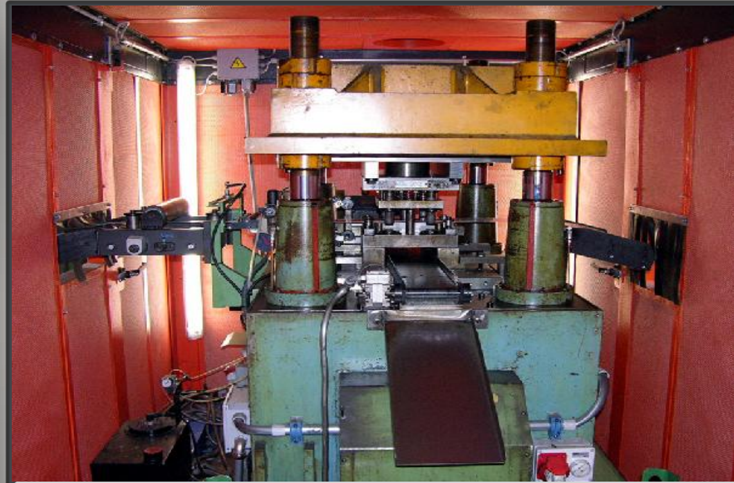
Press complete with die

Production line for punched edge protection angle profiles for floors or contour generally. Material: stainless steel, aluminium, brass, etc..... It is possible to put toolings (series of rolls) coupled on the roll forming line. Rapid change with cassettes of roll forming line. Fix cut. As option flying cut. Possibility of automatic insertion of labels with barcode.