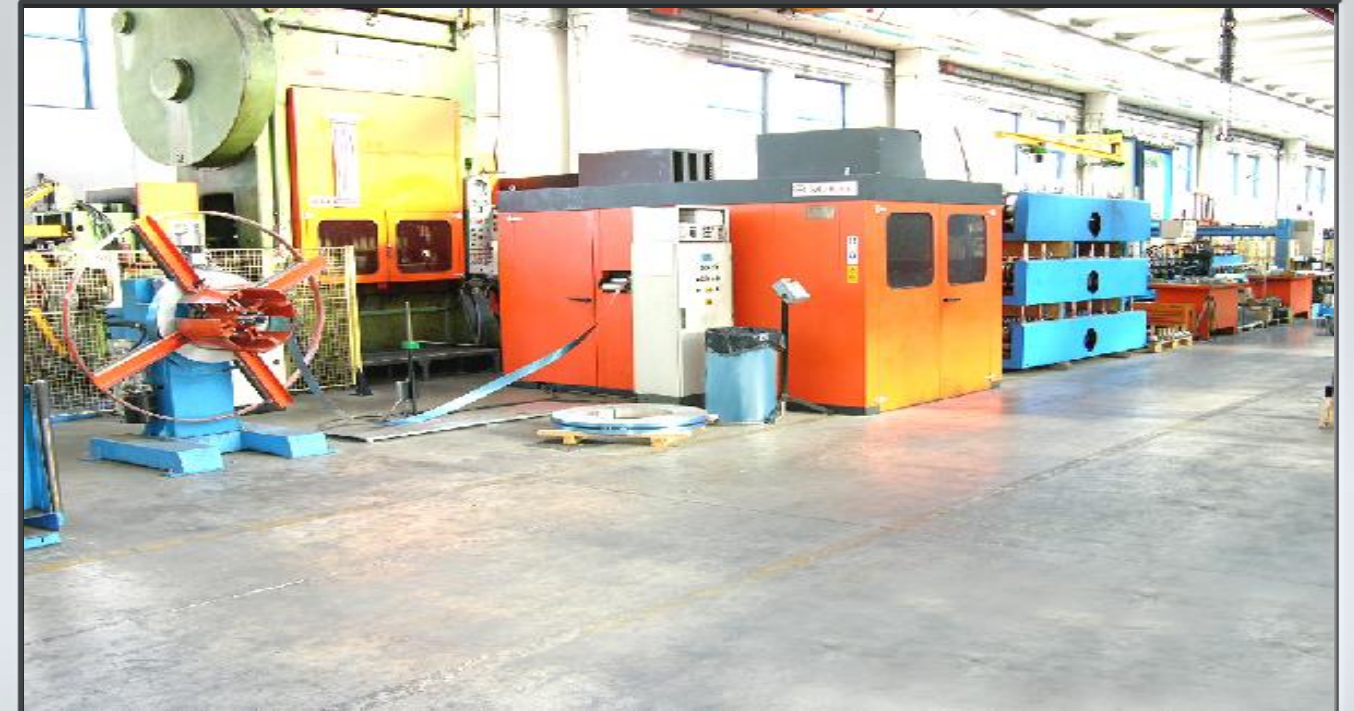
View of the machine